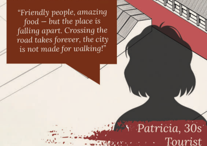
Patricia, 30s Tourist

"Eh, you notice or not? The five-foot way just dies at the corner. Then you kena walk on the road pulak."